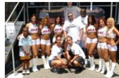
NBA NATION SPONSOR MIAMI HEAT DANCERS