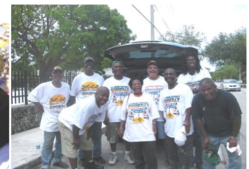
Coral Gables Sr. High Class of 1969 Grove Cemetery CLEANUP