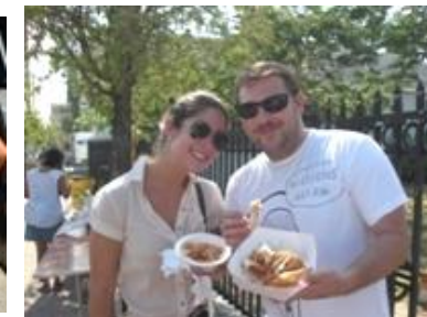
ATTENDEES MEANT/MARRIED AT THE GOOMBAY FESTIVAL