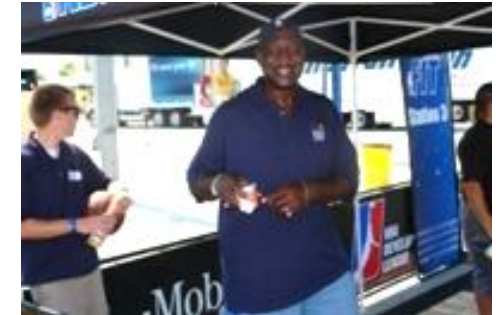
NBA NATION SPONSOR “DARRYL DAWKINS”