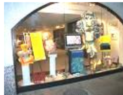
GOOMBAY ART WORK