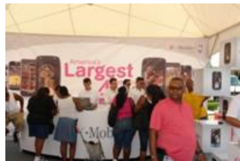
NBA NATION SPONSOR T-MOBILE