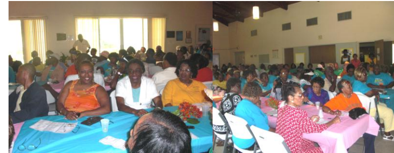
HISTORICAL/PIONEER LUCHEON AT CHRIST EPISCOPAL CHURCH