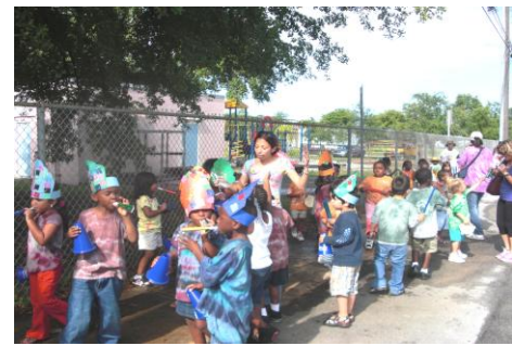
St. Albans Day Nursery Daycare GOOMBAY PARADE