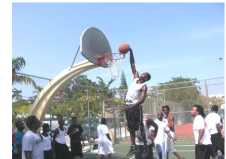
BOYS Basketball Goombay Tournament