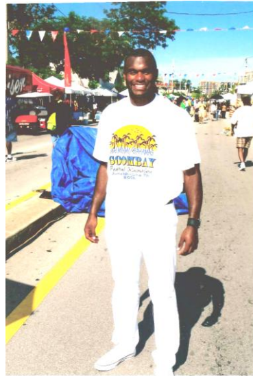
Myron Rolle KING OF GOOMBAY